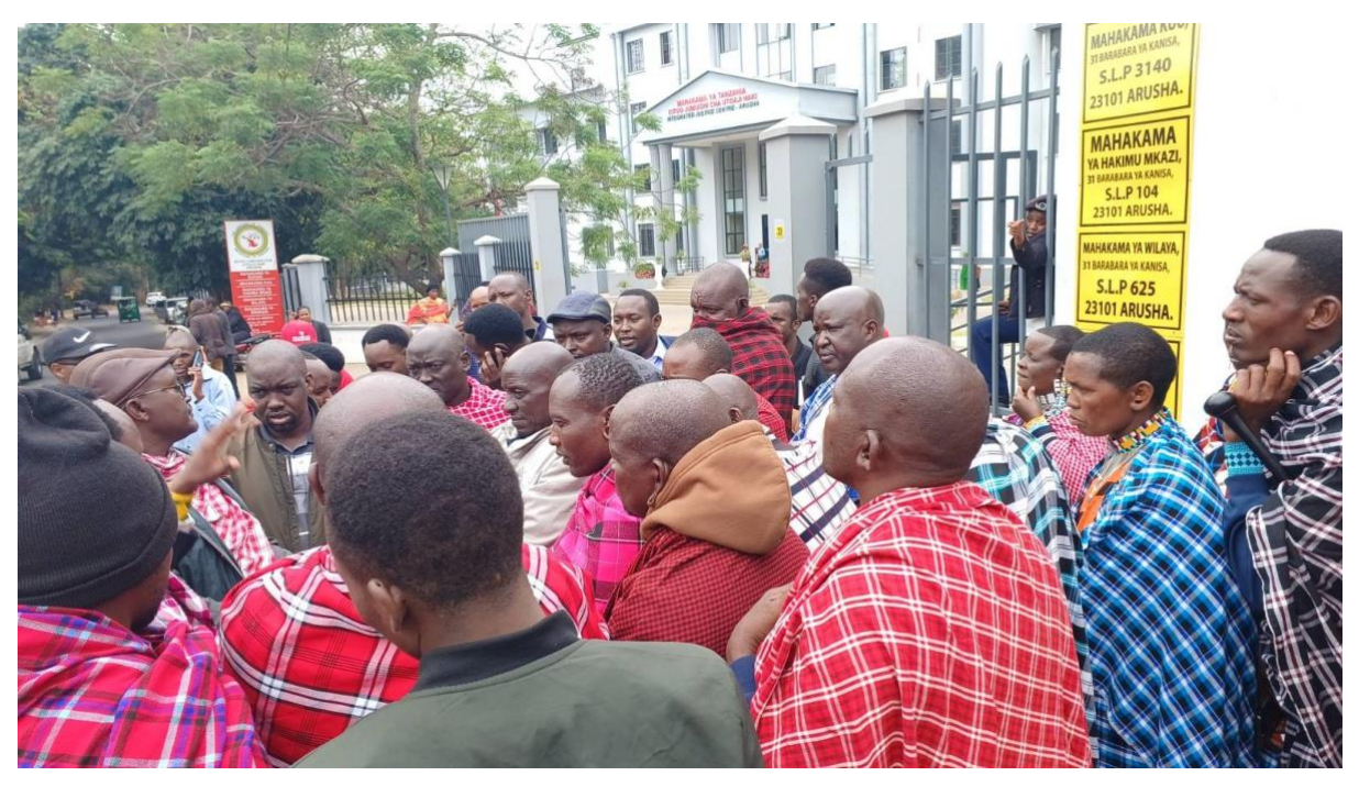
Maasai waiting outside of Arusha Court for Pololet ruling

Maasai leaders from 17 districts denounce state-organised <u>Maasai</u> <u>Festival</u>: "This fake festival is misusing Maasai culture."