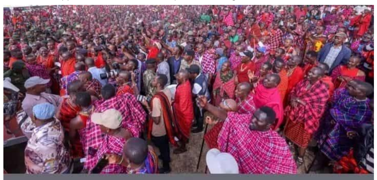
Crowd gathering in Ololosokwan, 8 September 2023

On 8 September, crowds gathered in Ololosokwan to hear Tanzanian opposition leader Tundu Lissu. It was expected that Lissu would cancel his visit to Loliondo following attempts to deny him the right to organise political rallies in Ngorongoro. But he was unstoppable. The Maasai want political change.