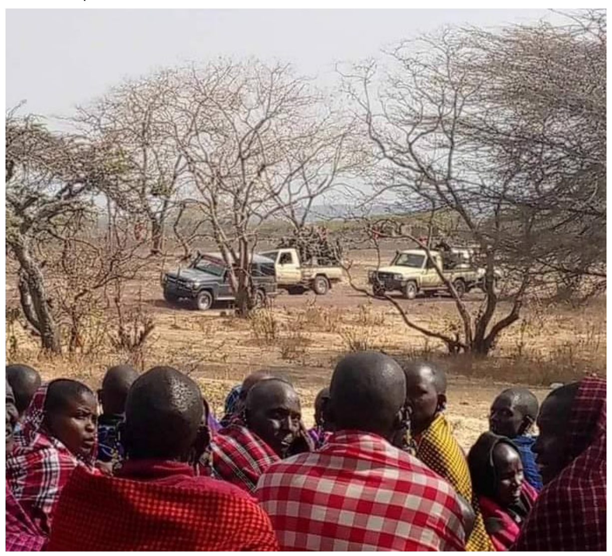
Riot police rounding up a women's gathering in Endulen on 10 September 2023. The women sit in peaceful protest against the government's denial of social services and refusal of Lissu's entry into Ngorongoro

teargas just a day after Tundu Lissu's entry denial into Ngorongoro to address three scheduled political rallies.