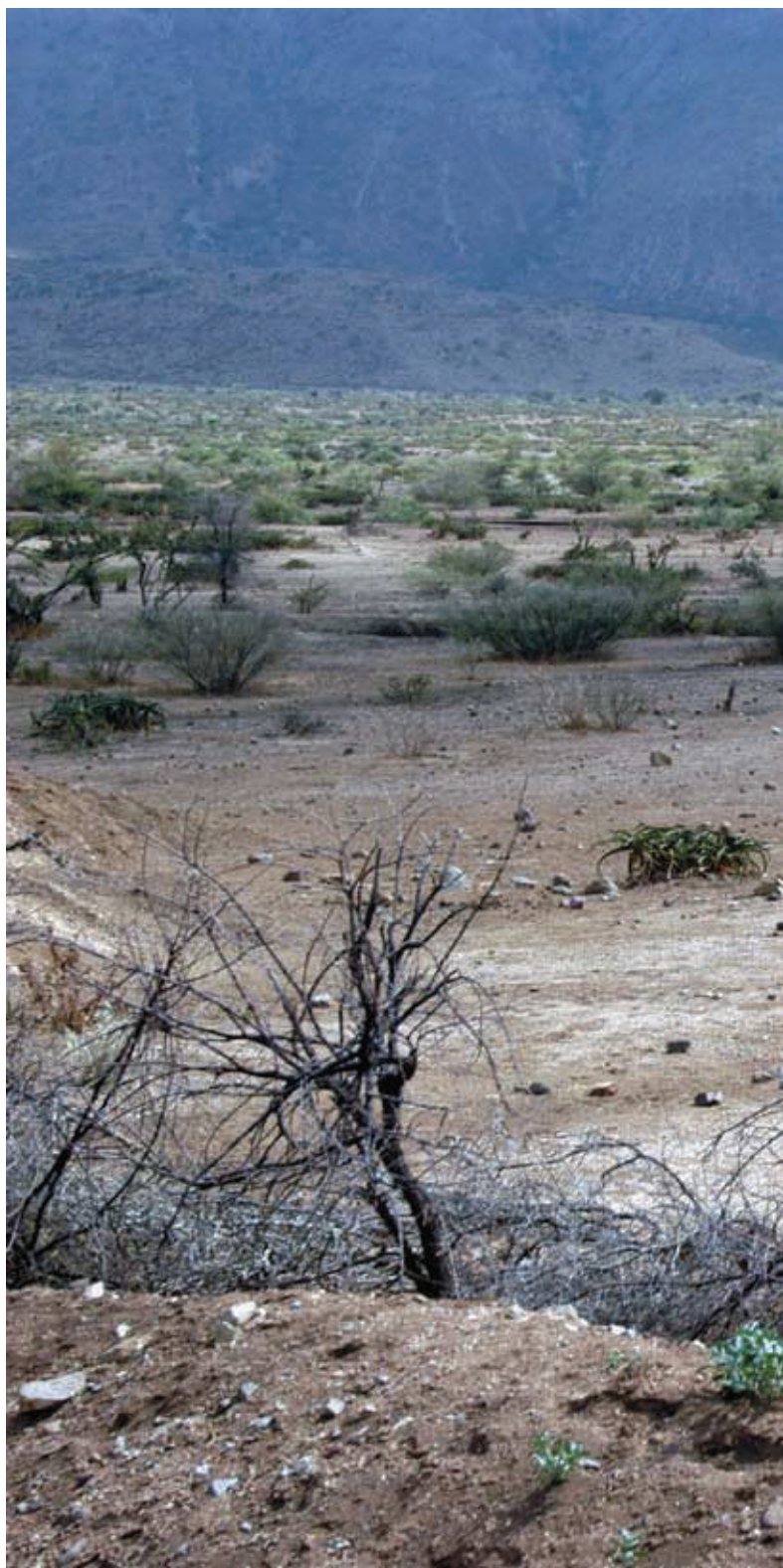
Afar dryland vegetation

Events such as conflict and disease outbreak interact closely with changes in the climate and in access to resources. Diseases outbreaks can be caused by droughts and floods directly (for example camels who drank flood waters got sick and died) or indirectly (such as drought in surrounding areas forcing other people and livestock to move into Mille, bringing diseases with them and infecting local livestock). In Mille, the effects of droughts have been further compounded by the increased exposure of humans and their herds to crocodile and hyena attack as a result of competition for resources and low river water. During drought, Mille pastoralists are also forced to graze in areas considered unsafe because of Issa attacks (the eastern side of the Awash river), with the risk of violent conflict. In Uwwa, influx of other pastoralists during drought, or the need of Uwwa pastoralists to move to other areas in search of pastures, can bring conflicts but also cooperation and potential incomes.