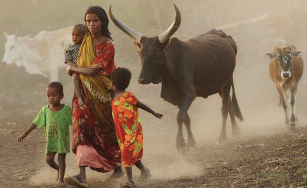
Afar cattle adapted to extreme heat

Although the most important adaptation to drought and reduced quality of rangelands was to increase mobility, interviews indicated that such mobility was also becoming more difficult and less viable. When asked to identify the main socio-economic changes that affect their livelihoods, people in Mille invariably mentioned the need to increase their mobility, to move in search of pastureland and water. People both in Mille and Uwwa were being forced to migrate further and more often, with several negative consequences. When moving to a different area, water resources may be scarce or difficult to locate, herds may be attacked by wild animals when migrating, or people and livestock may be affected by diseases that are present in the receiving areas. Informants also mentioned that the danger of disease and resource depletion was also present when droughts were not affecting their district, since people from neighbouring areas may be forced to migrate to Uwwa and thus they may bring human or livestock diseases and reduce their water and pasture resources. Yet, the drought was recognised as