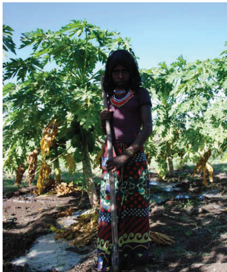
Afar girl assisting in farming