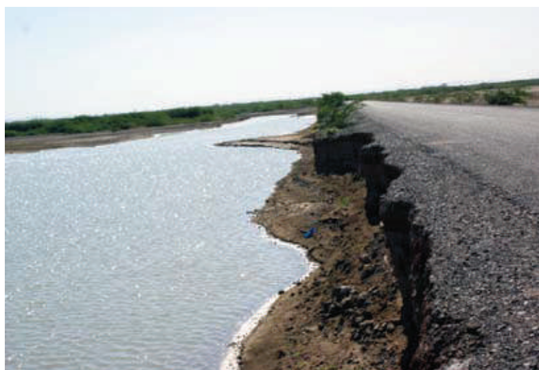
Flood destroying browsing resources and infrastructure