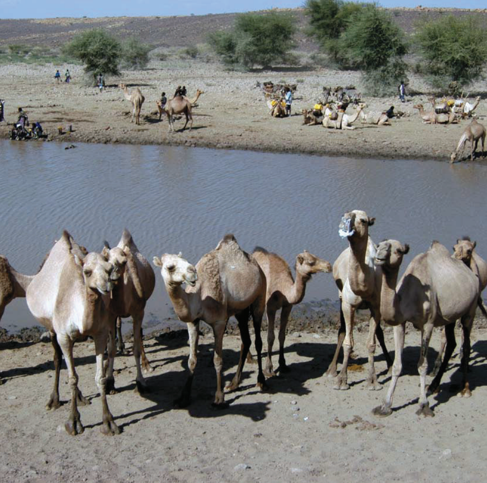
Camels drinking water at a riverbed