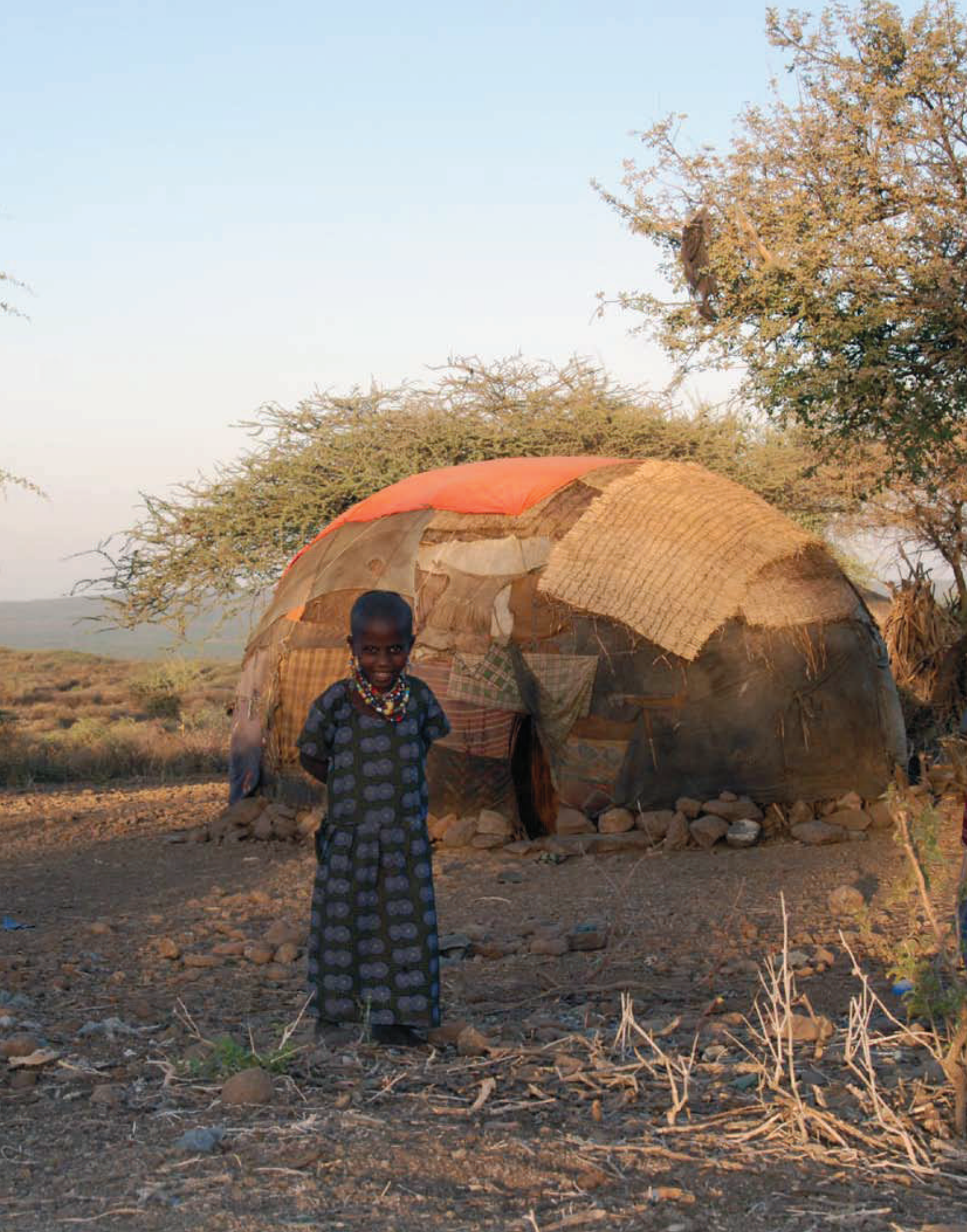
Afar girl in front of her house