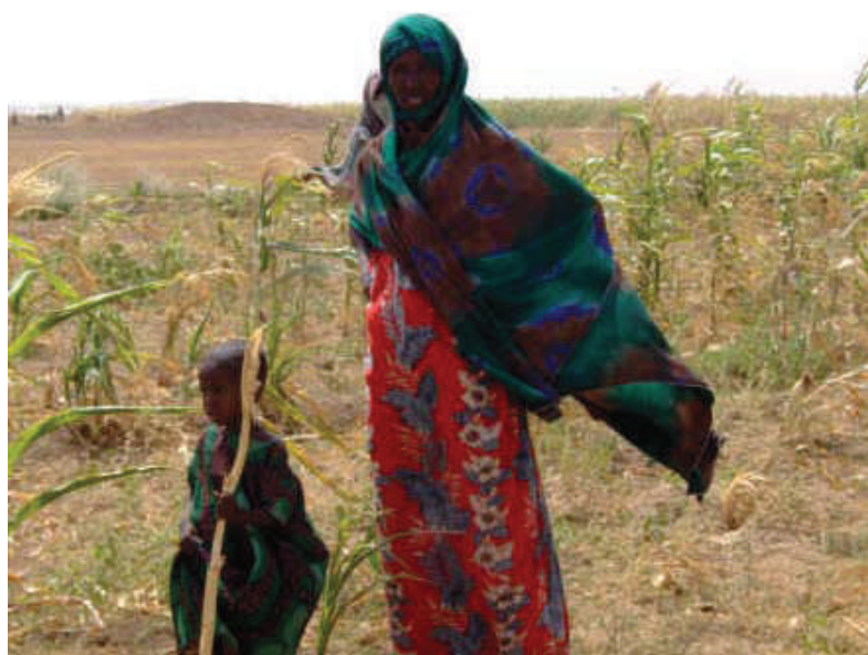
An agro-pastoral Somali woman farming her fields

Critically, the vulnerability context and people's responses vary between places and change over time. Therefore, sustainable adaptation does not pertain to identifying a particular 'sustainable' practice or action, but to develop a set of actions that contribute to socially and environmentally sustainable development pathways. The four normative principles can guide adaptation responses, and this study exemplifies the practical implications in an Ethiopian pastoralist context. Hence pastoral pathways – past, present and future - can provide lessons for the type of societal transformations required to tackle the climate change problem.