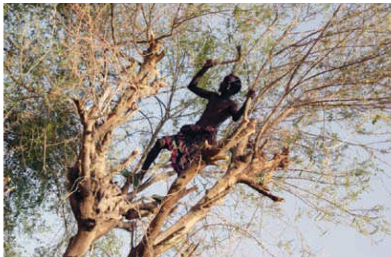
Afar man cuts tree branches

The lessons from Afar and Somali suggest that current some of the current adaptations to multiple stressors may contribute to reducing society's adaptive capacity overall and that of the vulnerable in particular, increase emissions of greenhouse gases, lead to depletion of rangeland resources, and create a precarious path dependency. In order to be more effective, adaptations need to contribute to more socially and environmentally sustainable pathways (Eriksen et al., 2011).