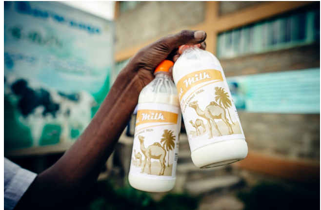
Sean Sheridan / Mercy Corps

In March 2020, governments across the Horn of Africa established mitigation measures to prevent the spread of COVID-19. Initial measures included suspending international flights, closing international borders and limiting gatherings of large groups of people. Closure of international borders along with suspension of night-time travel has resulted in bottlenecks and delays in the movement of goods including animal health inputs, raw ingredients for animal feed (maize, soya, imported supplements), and live animals; resulting in higher operating costs for traders and increased prices for retailers and processors. 2 The sequencing and timing of more stringent mitigation measures varied by country, but the closure of markets and localized movement restrictions, and the subsequent loss of jobs and income caused by these restrictions, created severe economic impacts across all countries. Ethiopia is projected to lose close to 10 million jobs in the private sector, inclusive of the self-employed and employees of small and medium-sized enterprises (SMEs). Additionally, household and business spending in Kenya has reduced by 50 percent due to lost income and revenues. 3