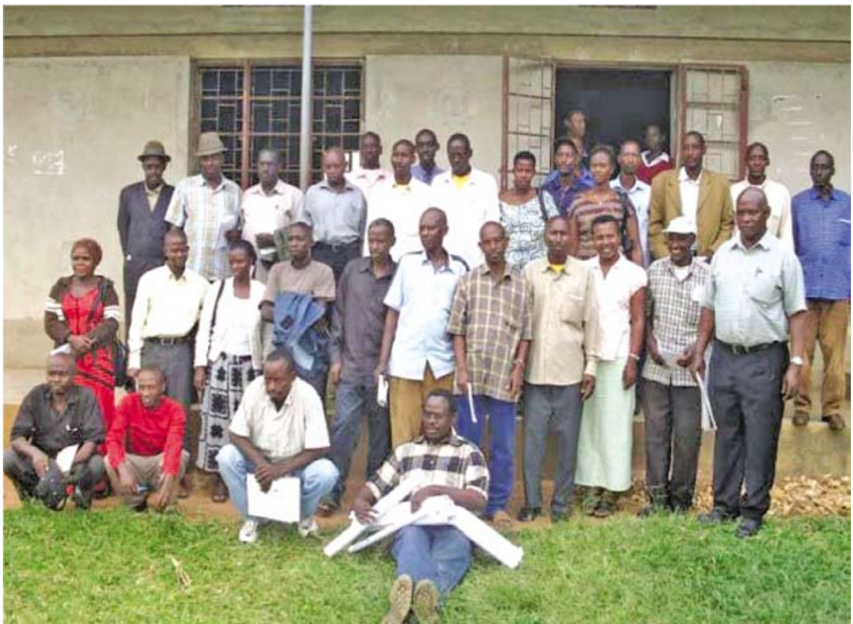
Participants during the herders' meeting held on 5/3/09 in Sanga, Nyabushozi, Kiruhura District