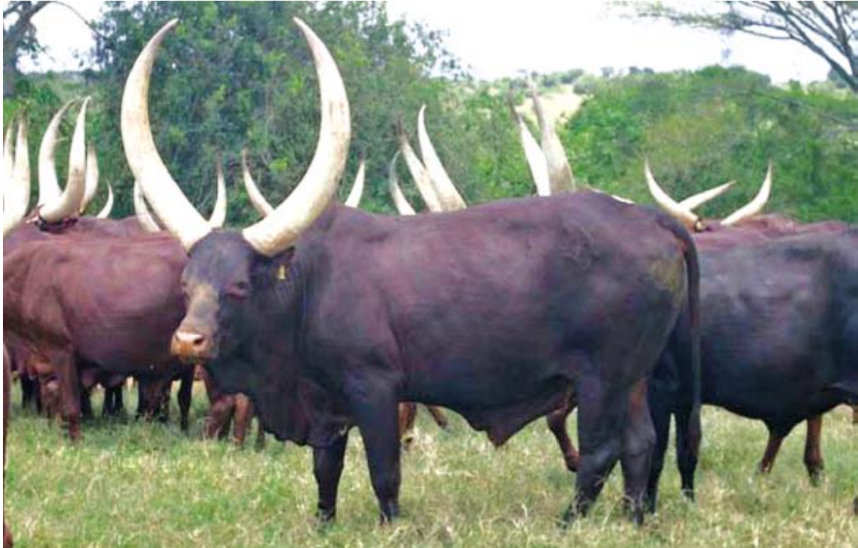
Ruhogo” (deep brown coloured bull) – with some of the special qualities considered for selection