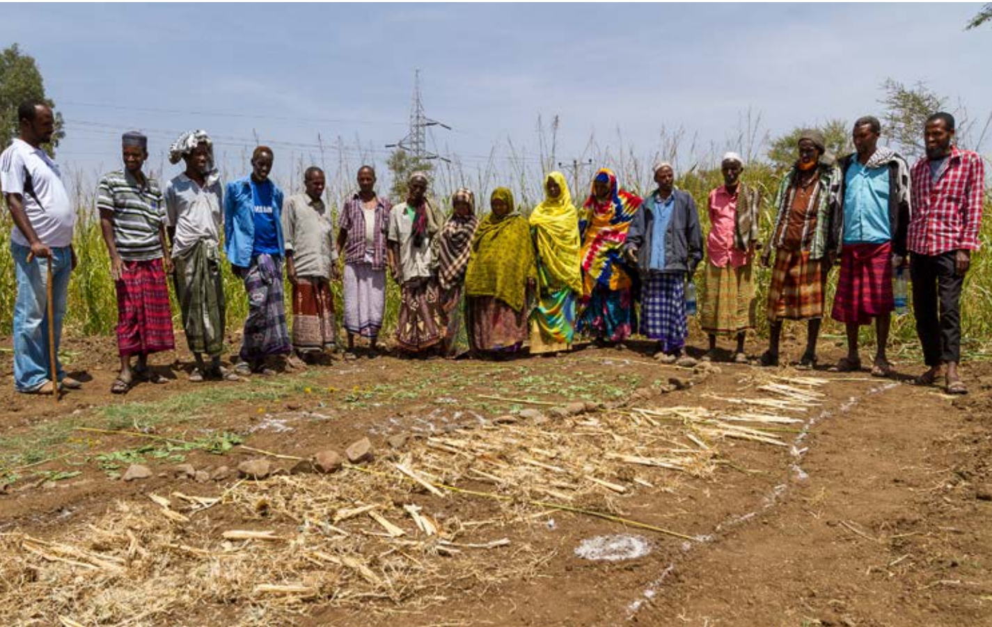
Photographs of the finished map are an important record for the mapping report.