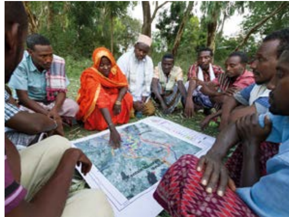
Mapping participants work together to validate a digitized map of their rangeland.

Once the final laminated, hand drawn, validated version of the map has been produced and disseminated, a decision can then be made with the community on whether or not the map should be digitized. The mapping team should explain that a digitized map could be more easily compared to other maps, such as topographic maps. A digitized map may also be