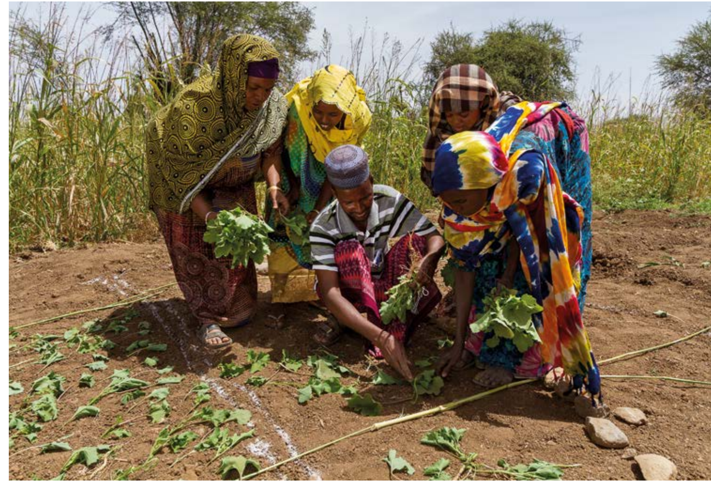
Producing a ‘map’ on the ground enables communities to explain their resource use to those from outside their community.

There are a number of advantages to digitizing community drawn maps with the participation of the communities that made them. This gives the community greater control, builds capacity, and provides a valuable tool for communities needing a baseline for discussions and negotiations with other stakeholders.