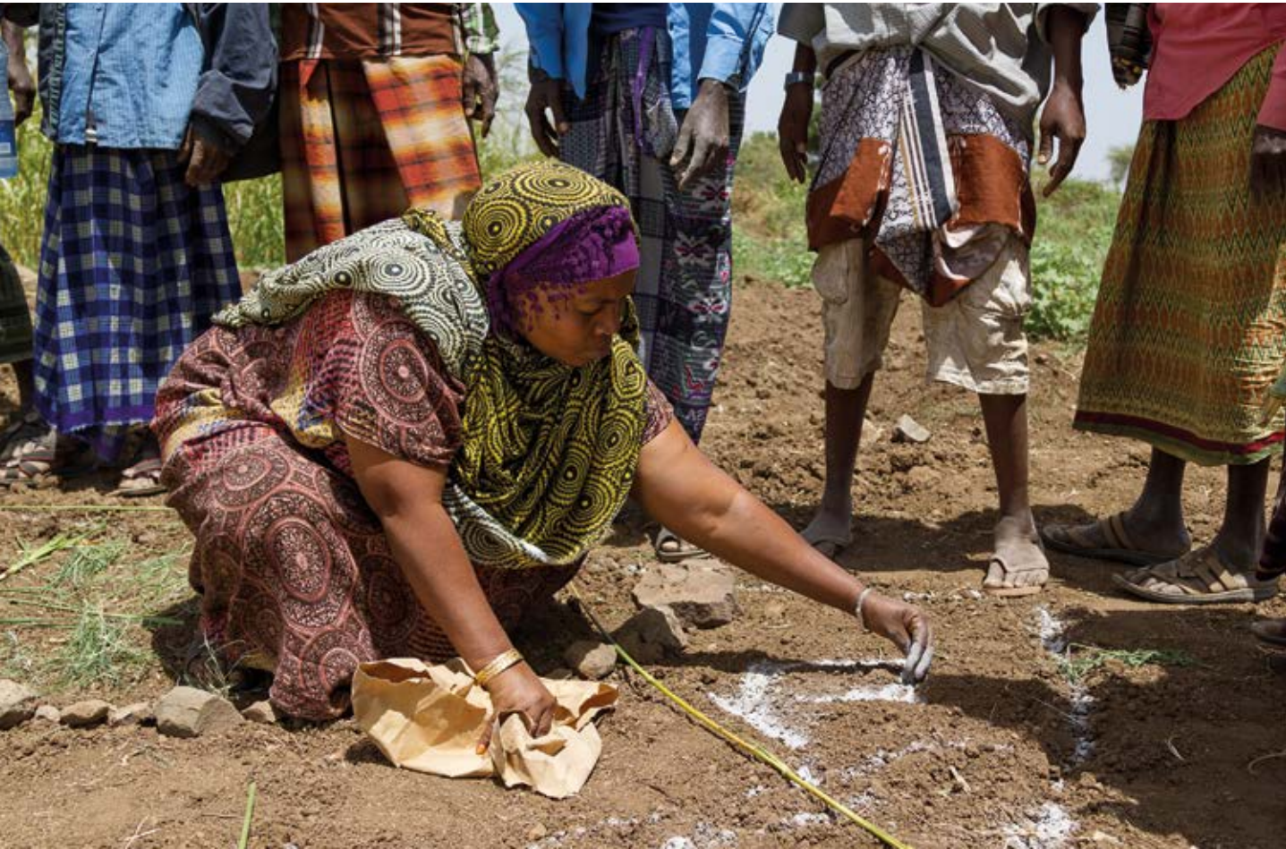
Good questions can prompt the community to add important details and information to the map.