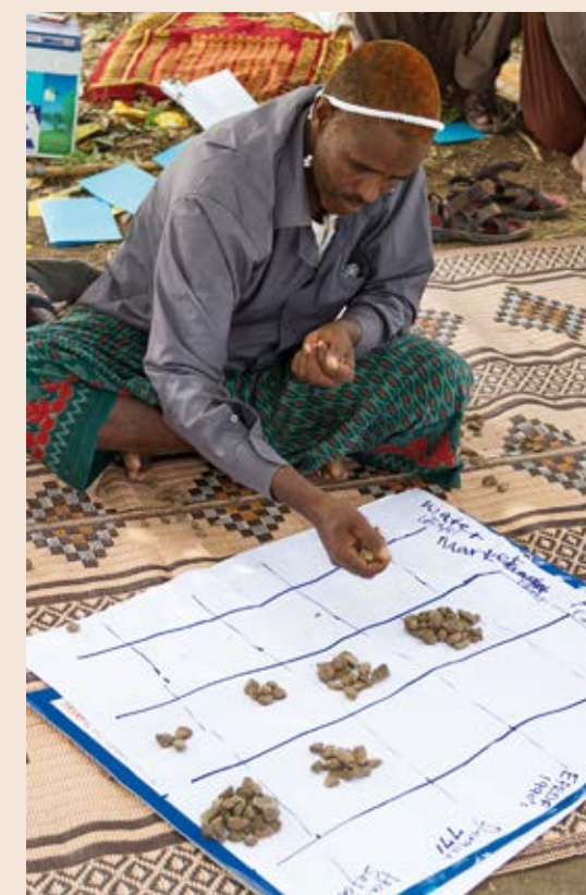
Resource trend analysis is a valuable complementary tool to mapping.