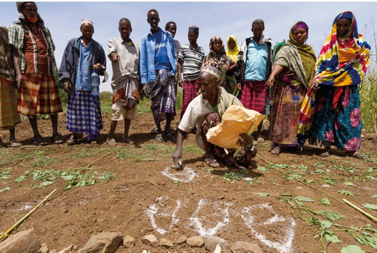
Being highly visual and inclusive, mapping can help increase levels of participation in all stages of PRM.