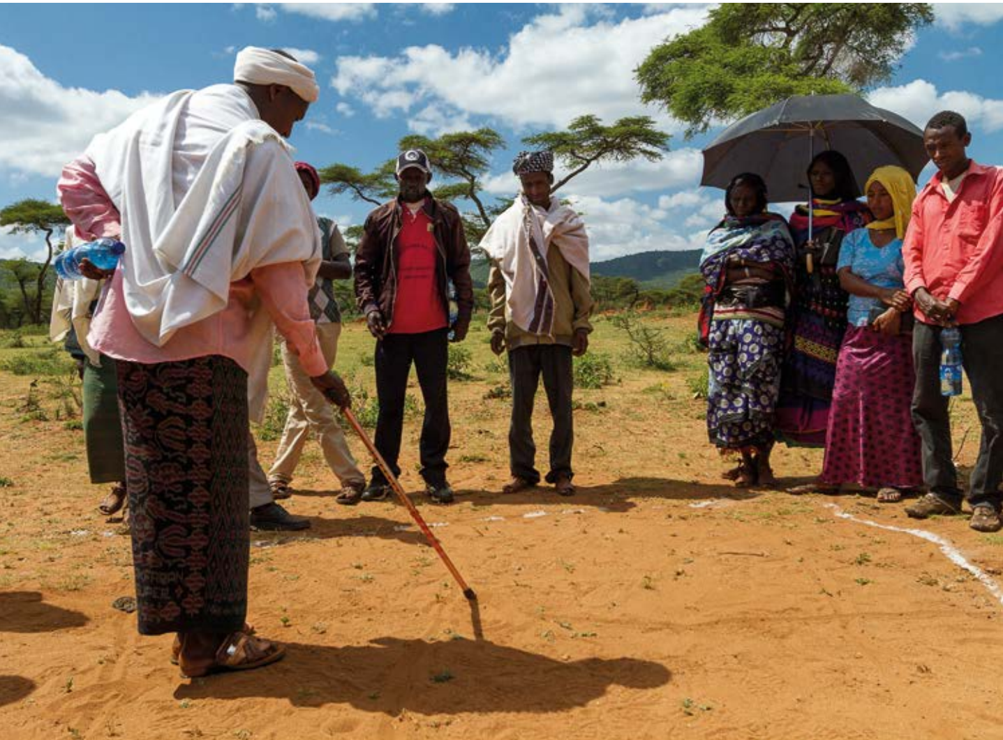
Locating a key landmark that everyone knows is a good starting point in mapping.