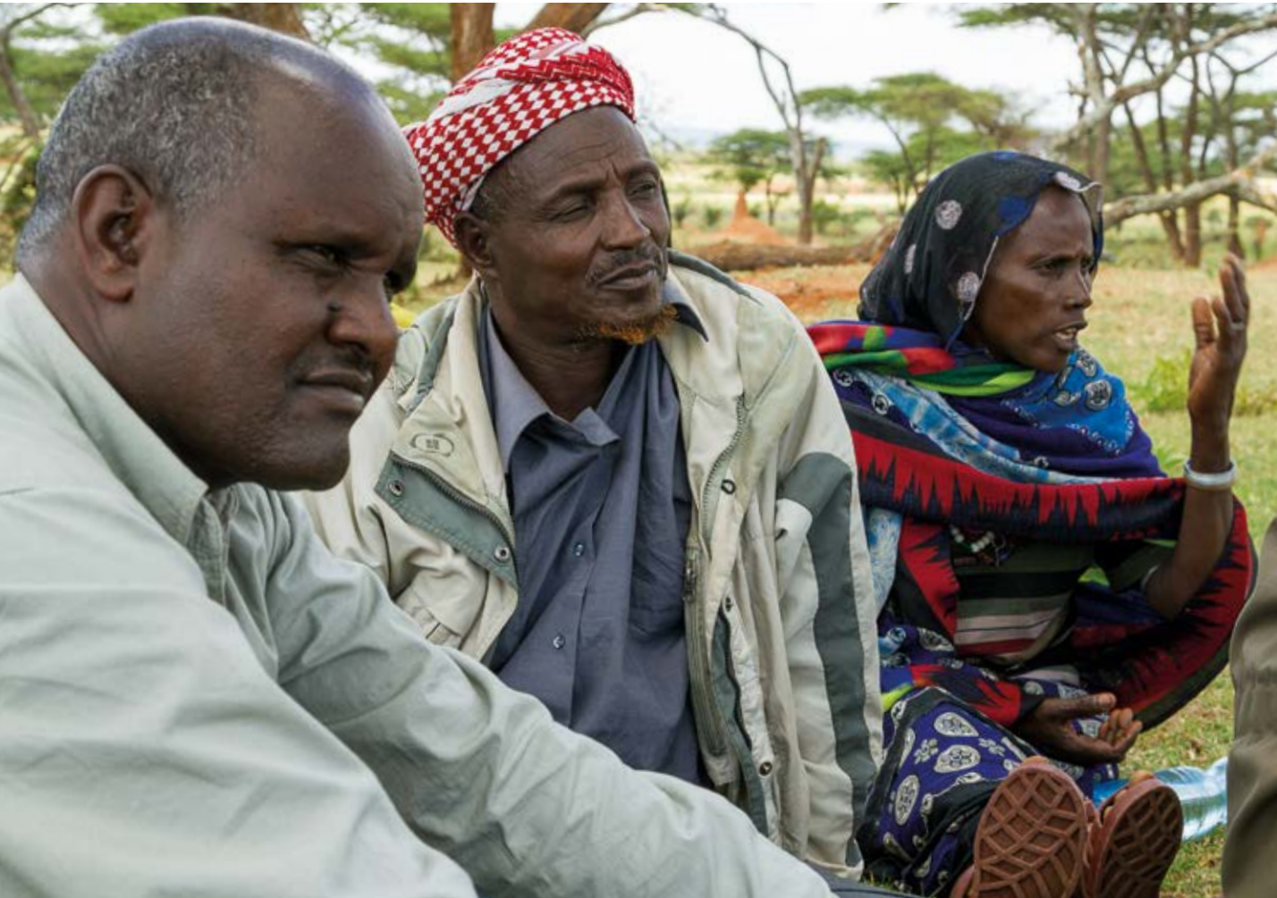
Working closely with the community throughout the preparation phase is key to ensuring a successful mapping exercise.