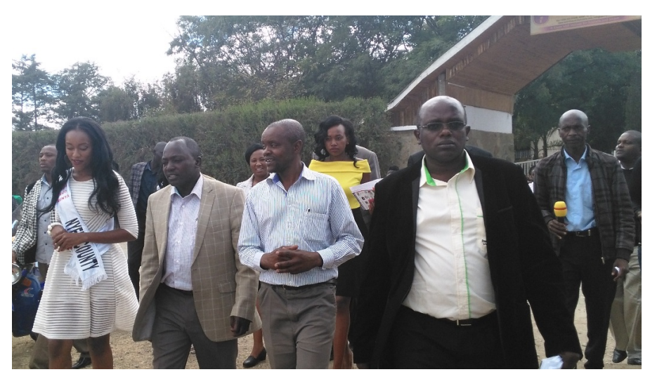
Figure 3 The Governor of Laikipia County, second from left, joining the exhibition site

Social exclusion and marginalization, insofar as they refer to groups or communities, are self-reinforcing terms and could be used interchangeably. Those who are socially excluded can rightly be regarded as margina-