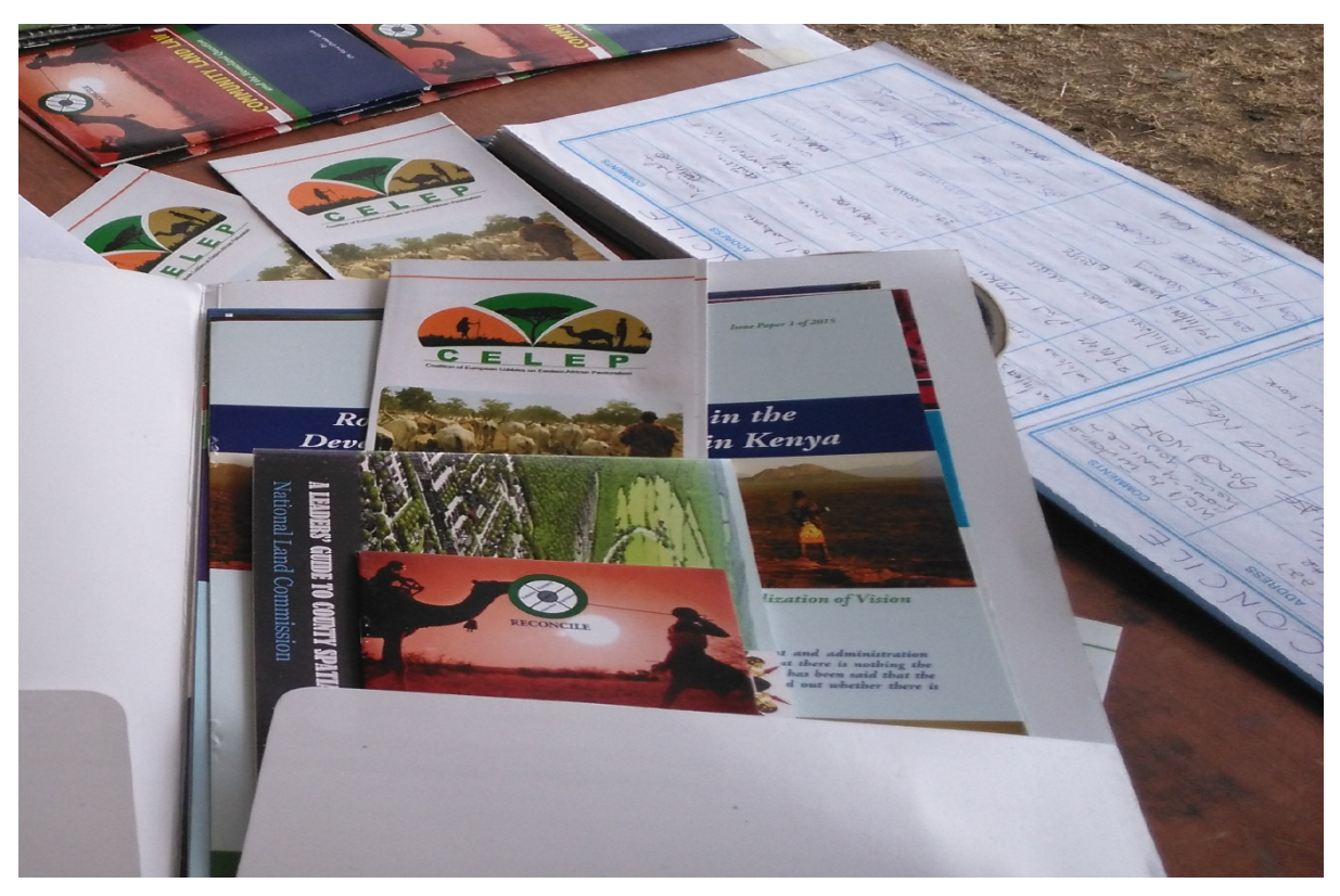
Figure 4 Publications shared with participants who visited RECONCILE tent in a packet including RECONCILE profile, CELEP information, Community Land Law brief, County Spatial Planning Guide, among others.