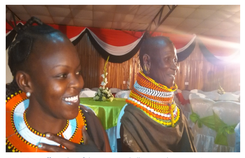
Figure 2 A staff member of the Kenya Land Alliance and a community representative from Turkana County following the evening events

they have difficulty moving the herds between poorly linked territories. They have been more overtly excluded from participating in development and in decisions to define investment in their space. The prevalent narratives about pastoralists create negative and contradictory interpretations of their activities. This makes it even more difficult for them to gain the respect and recognition that other development actors receive