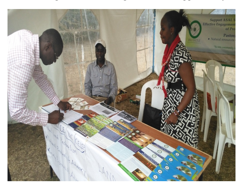
Figure 1 RECONCILE staff with a participant signing in visitors book at the tent

number of state and non-state development organisations, partners such as the Kenya Agricultural and Livestock Research Organization (KALRO), ActionAid, SNV, the Christensen Fund, County Government of Laikipia, RECONCILE, Turkana Devel-Forum, opment Pastoralist Development Network (PDNK), League of Pastoralist Women of Kenya, the Kenya Livestock Marketing Council among other partners and coordinated by CEMIRIDE (Centre for Minority Rights Development).