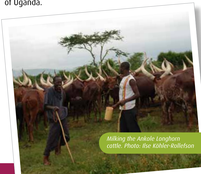
Milking the Ankole Longhorn cattle.

Their keepers, the Bahima, are an ethnic pastoral group of the Ankole people who live in an area stretching from the South West to the North East of Uganda.