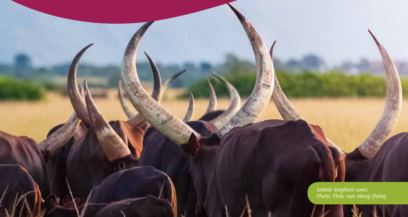
Ankole longhorn cows.