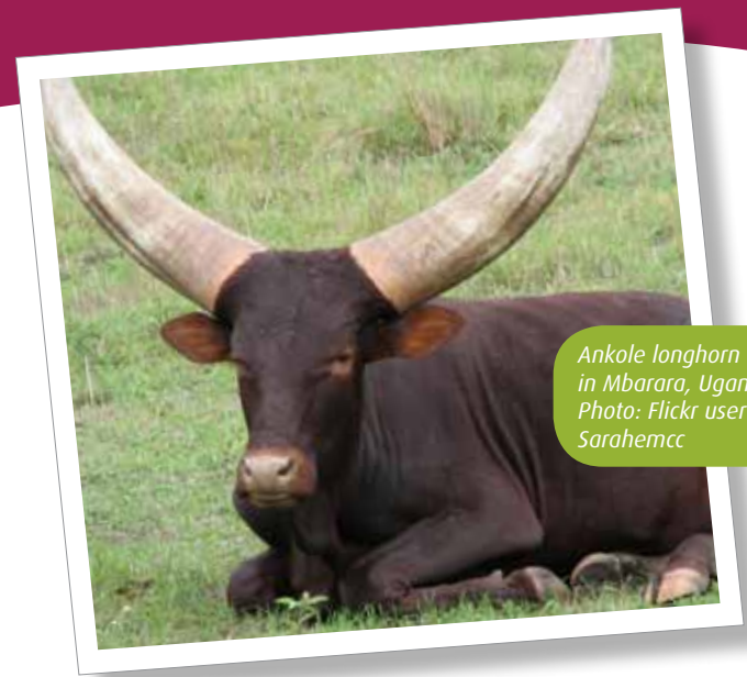
Ankole longhorn cow in Mbarara, Uganda.

Yet some challenges remain. Government policy still forces the pastoralists to leave their livelihood and promotes the modernisation of agriculture. Meanwhile rich investors, national parks and oil companies threaten the land on which the Bahima