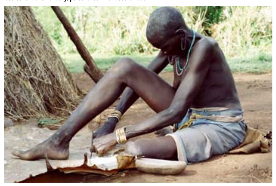
Photo: A Mursi woman preparing a new leather skirt. Shauna LaTosky 2007

In Asia too, it is women who control the "domestic sphere" taking responsibility for the work, order and economic productivity (see Box 10.2).