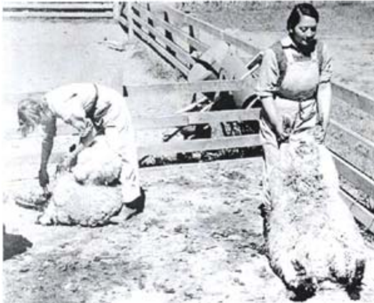
Photo: 'Women crutching sheep' in New Zealand in the 1940s (see file).

Processing tasks, such as slaughtering or hide processing, can be assigned exclusively to one or the other sex. For example, in most East African societies, men are responsible for slaughtering animals and extracting blood. But among the Maasai, although men and women deny it, women do slaughter cattle and small ruminants (Talle 1988). And amongst the Koochi of Afghanistan, men may slaughter the animal, but it is women who clean the internal organs and prepare the meat for cooking (Davis 1995). The processing and use of hides in Asia has always been men's work, in contrast with such as the Maasai and Barabaig of Tanzania, where women have sole responsibility for this task. It is often assumed that mainly men shear sheep, however as the photo below confirms (women 'crutching sheep' in New Zealand), this is not always the case.