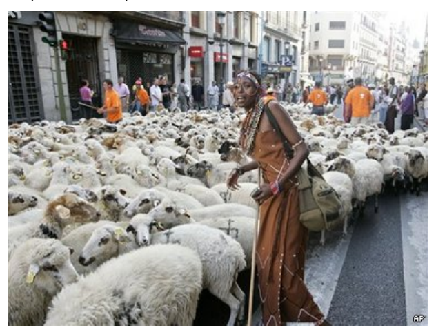
Photo: An African woman at the Segovia Gathering helps guide a flock of sheep through the streets of in Madrid, Sunday Sept. 9, 2007. Harold Heckle, Associated Press

In Europe too, as movements in rural areas have been revitalised and increased in profile and strength, remaining shepherds and pastoralists have also mobilised themselves in order to highlight their needs and concerns. In Spain for example, an annual festival is held which highlights pastoral concerns and calls on authorities to protect 120,000 km of paths used for seasonal movement of livestock, from cool, highland pastures in summer to lower-lying ones in winter. Some of them are 800 years old. The festival which includes herding hundreds of sheep down the streets is held in Madrid which lies along two of the north-south routes. One of these dates back to 1372. In 2007 the protest coincided with a global gathering held in the country. A number of pastoralists attending the gathering also attended the protest. This included a pastoral woman from the Samburu who assisted the Spanish shepherds in their protest.