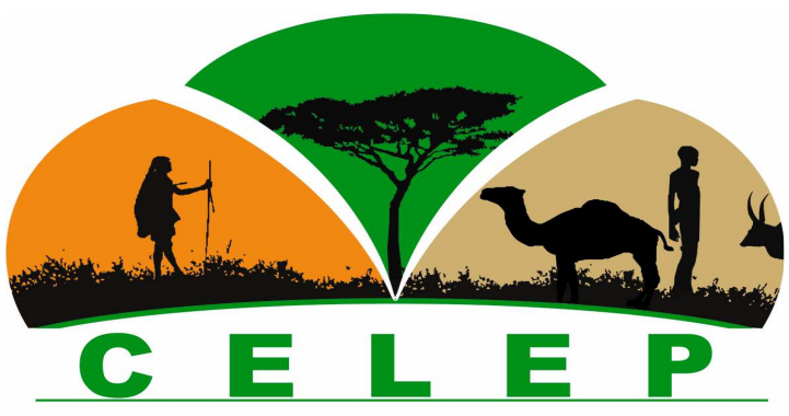
Coalition of European Lobbies on Eastern African Pastoralism