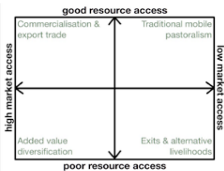
Figure 2: Four livelihood scenarios for future pastoralists

‘Traditional mobile pastoralism’ is becoming rare, but is still an important scenario where market access is poor, options for commercialisation are limited and resources still relatively plentiful – in parts of the ‘Karamoja cluster’ of north-western Kenya, north-eastern Uganda and south-eastern South Sudan, and the Omo River Delta, Ethiopia. In virtually all other areas, increasing pressures are shaping pastoral livelihood options and opportunities. ‘Land grabs’ – local and external